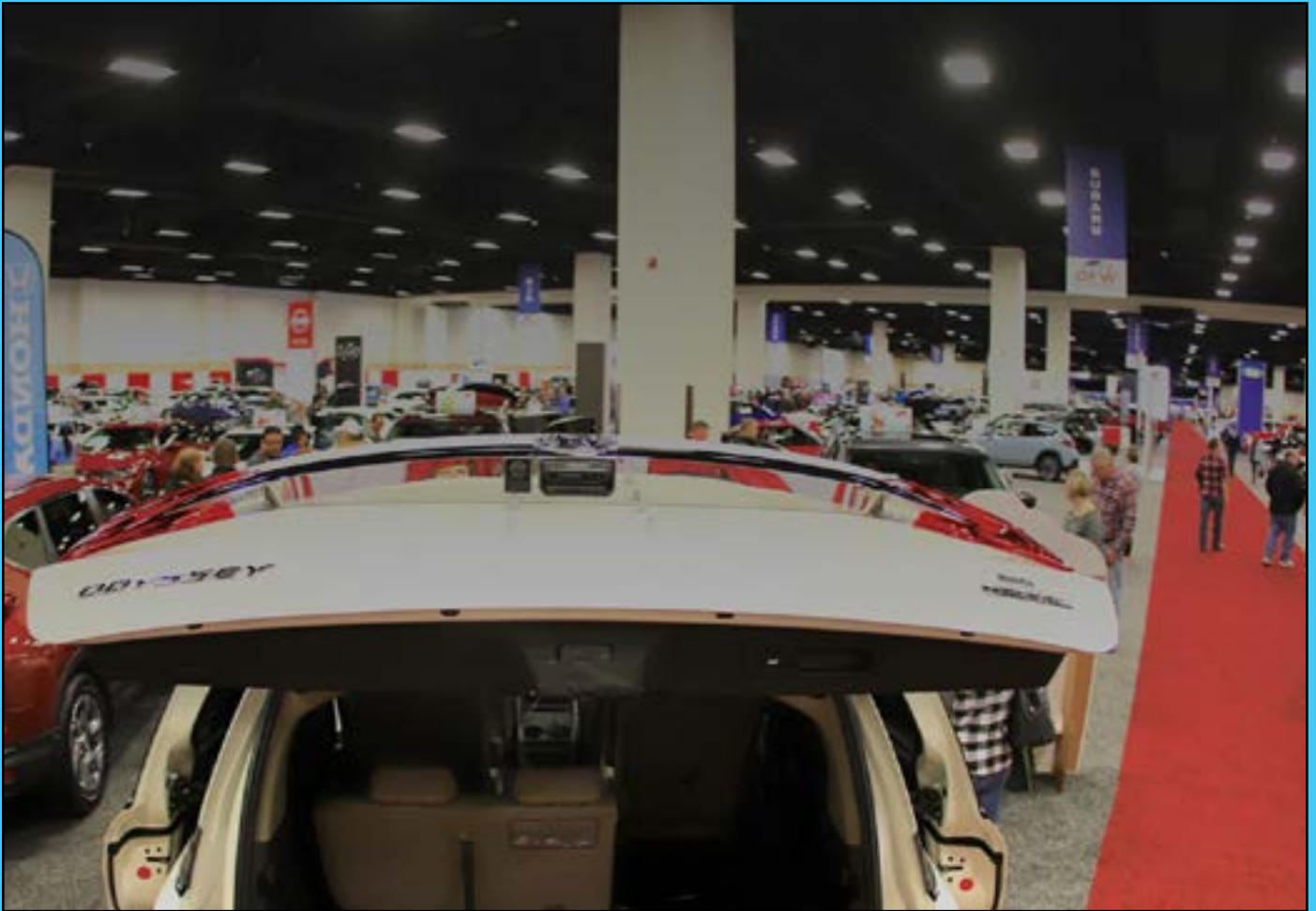
Fort Worth New Car Show - November 8 - 10, 2019