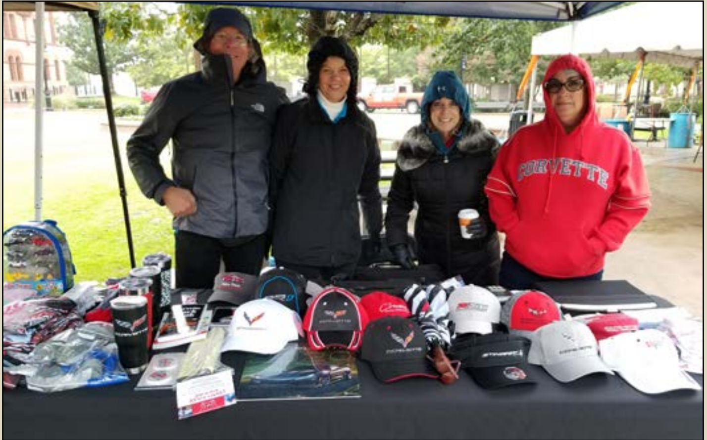
Us freezing at the Sulphur Springs car show.