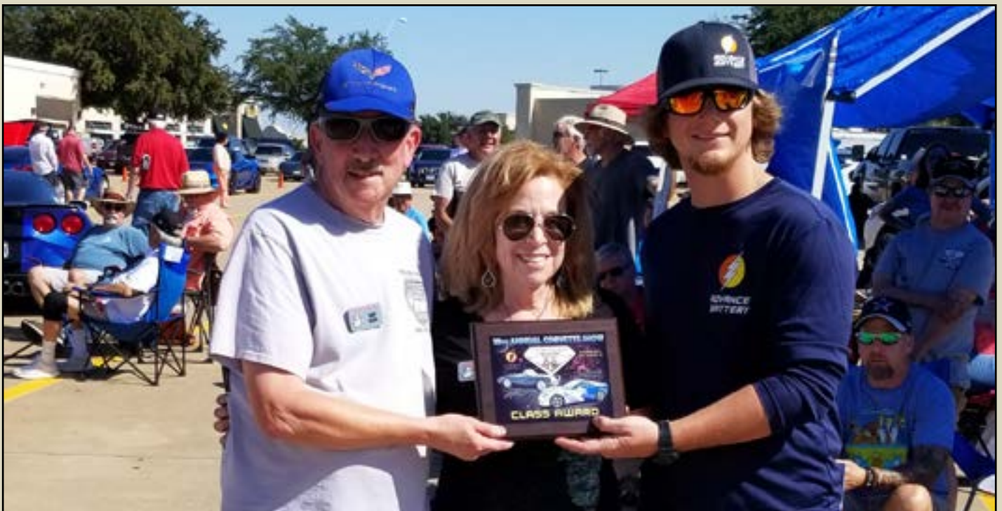
Fort Worth Cowtown Vettes car show Class Award