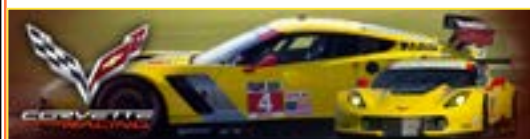
Corvette Racing 2019 IMSA Series Race

As always, please watch our club site for updates and new listings.