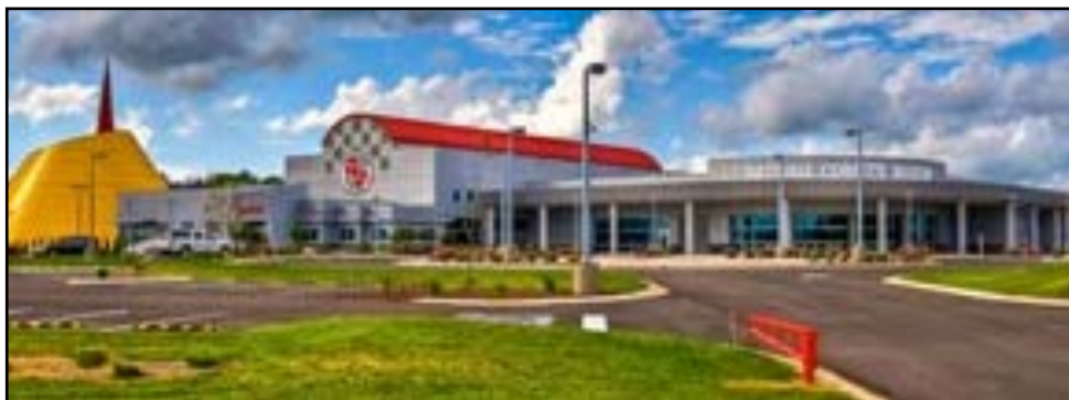
NATIONAL CORVETTE MUSEUM