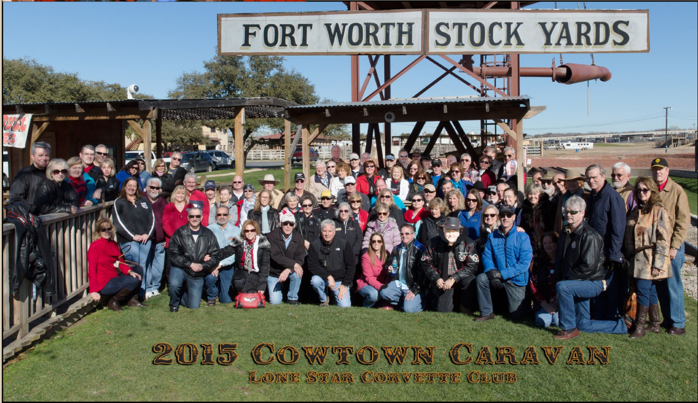
2015 COWTOWN CARAVAN LONE STAR CORVETTE CLUB

Continued from In-Town on Page 10... car show or cruise-in event, please use the members only forum web blog page, Cruise Nights . There you can add a post regarding an upcoming show or cruise night that you would like to attend. You can also view other events that