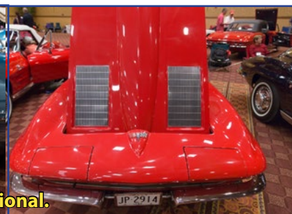
More photos from the 2013 Lone Star Regional.